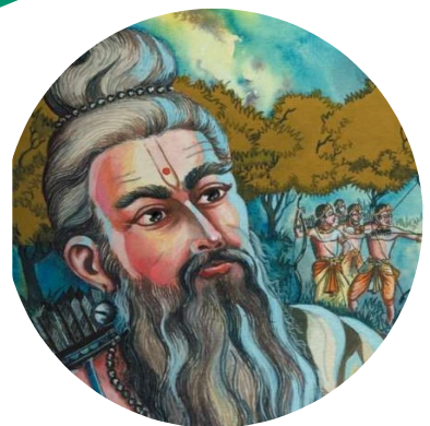
Arjun Mentor Dronacharya